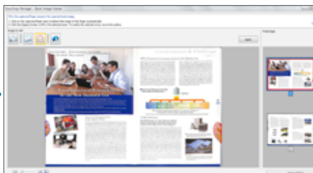
Point retouch function Fingers captured during scanning can be removed.